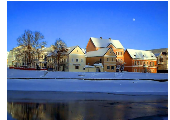
Minsk, a colourful capital

The tour is thirty days long, but is divided into three different periods, so that the volunteers that want to stay ten days are able to do it. The first period will start in Bielowieza, and the second one in Minsk.